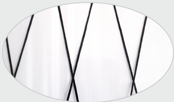
T725 fibre reinforced X-PLY® laminate